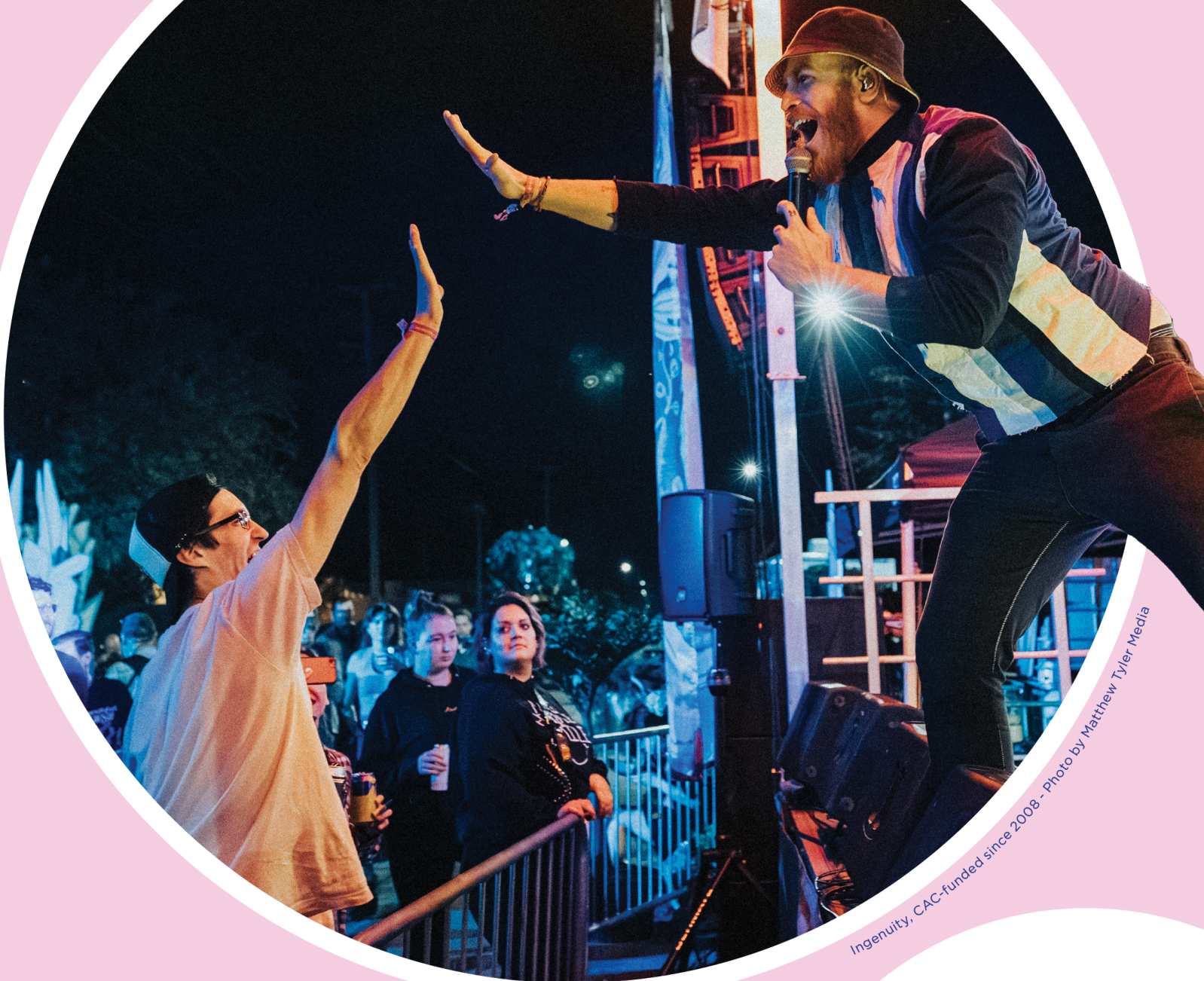
Ingenuity, CAC-funded since 2008